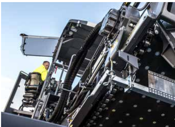
HEIGHT ADJUSTABLE PLATFORM FOR EXCELLENT OVERVIEW