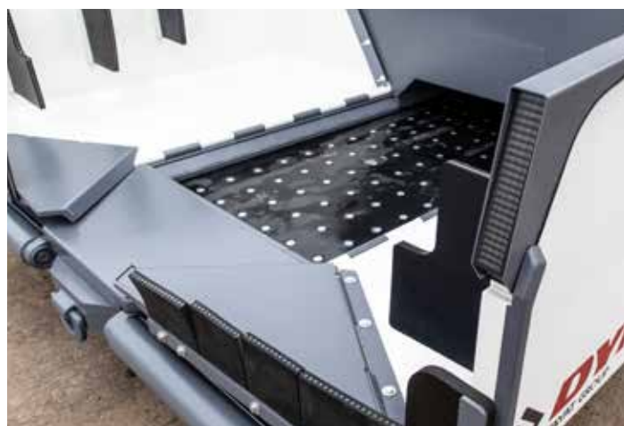
LARGE CONVEYOR TUNNEL FOR BULK MATERIAL TRANSFER

Dynapac feeders are best known for their powerful and durable conveying systems. The 1200 mm wide conveyor with