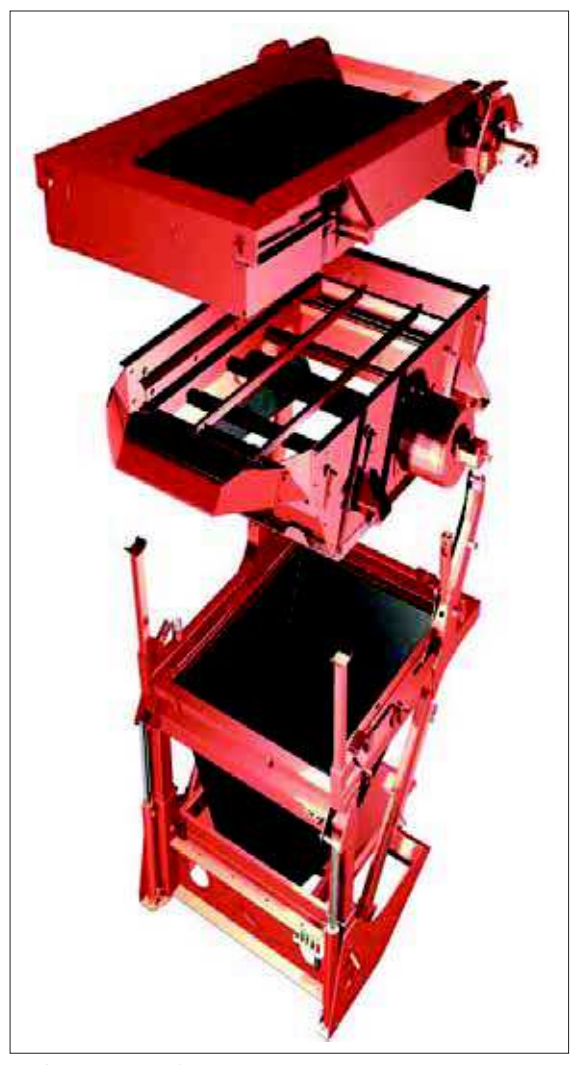
Pre-Screen Module (Optional)